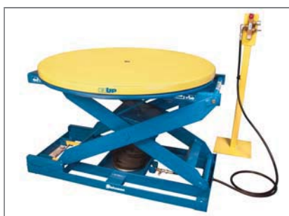
EZU-15-R With Optional Valve Stand

* Stainless steel model for washdown and clean room applications All accessories are field installable