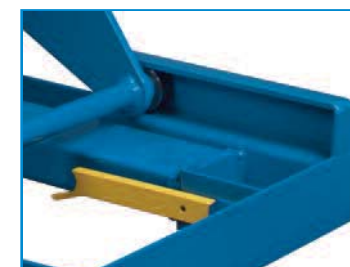
Rollers Are Entrapped In The Base Frame And Platform For Added Stability

The Bishamon EZ-Loader Complies With All Machinery Directive 2006/42/EC Safety Requirements - And Is CE Approved!