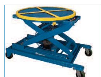
Cart portability with 2 swivel and 2 fixed caster wheels