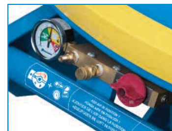
EZ-Adjust Knob Provides Up To 1200 lbs Of Capacity Adjustment With the Turn of a Knob