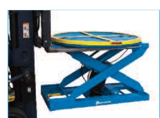
Easily moved with a fork truck