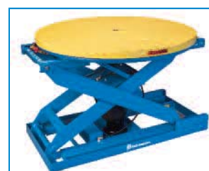
Solid rotating top