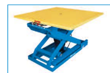
Oversize rotating platform