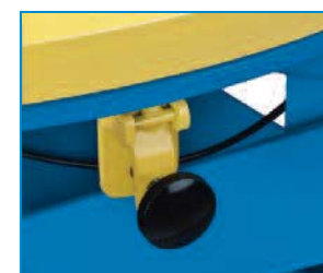
Brake prevents rotator ring from turning