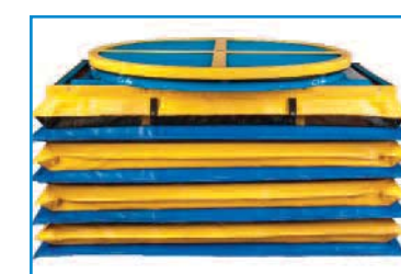
Accordion bellows skirting