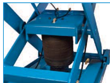
Unique Patent-Pending, Self-Contained Pneumatic System Offers Unsurpassed Performance