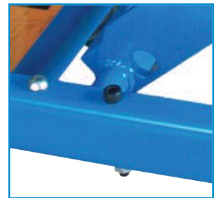
Heavy-duty locking pin prevents the unit from lowering for maintenance