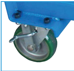
High-quality casters with locking brake for smooth transport